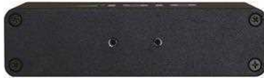
ANYWHEREUSB 2 PLUS BACK