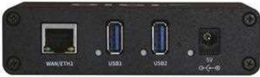
ANYWHEREUSB 2 PLUS FRONT