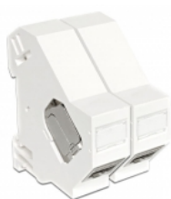
Anwendungsbeispiel mit Stecker