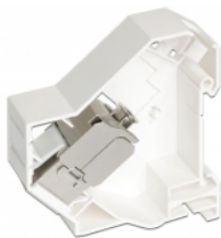
Anwendungsbeispiel mit Stecker