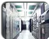
Data Center Management